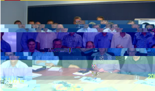
CTS Management Committee, 14 th November 2007