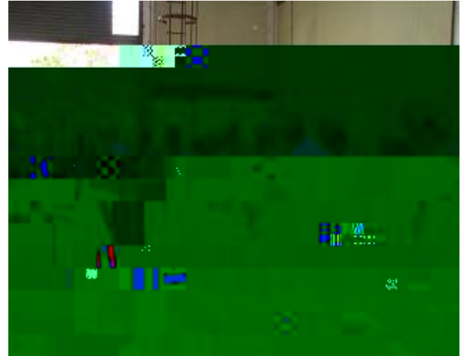
Tour of research/testing facilities for Anniversary

The celebrations included a tour of the Research and Testing Facilities, AirBox Facility, Wind Tunnel and Air Cannon.